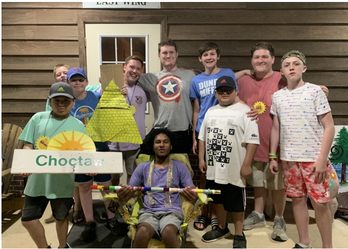
↑ Pictured: Congrats to the Choctaw cabin for taking home the spirit stick on the last night of camp! Pharaoh Pharaoh!!