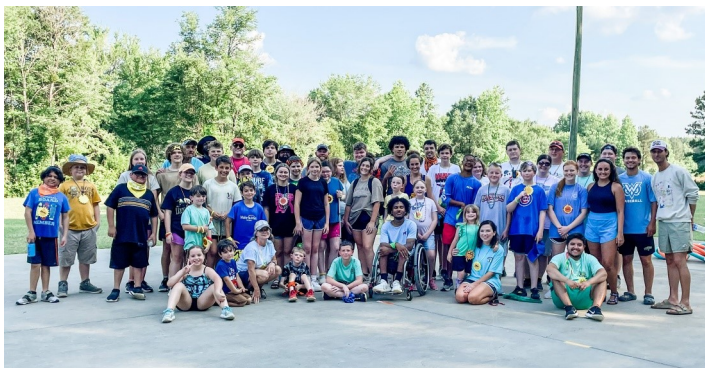
Team Activities...It's kinda our thing. Camp Olympics ↑ ↑ - Capture the Flag ↓ ↓